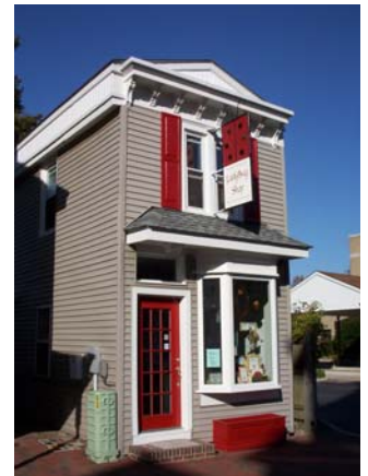
The LadyBug Shop

The LadyBug Shop will open its doors to shoppers in Milford in November, it